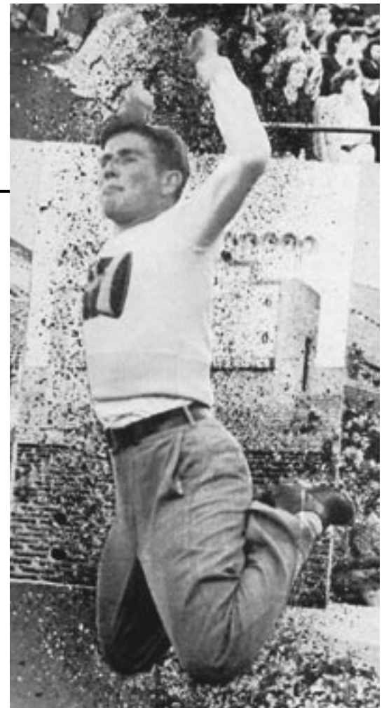
Yell leader photo: 1948 Surveyor