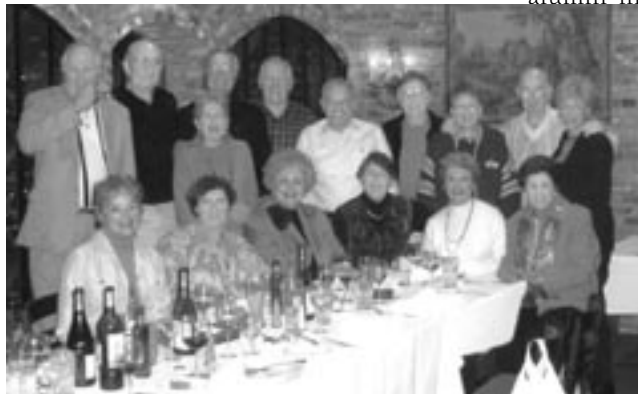
Final pre-reunion committee meeting: Back: