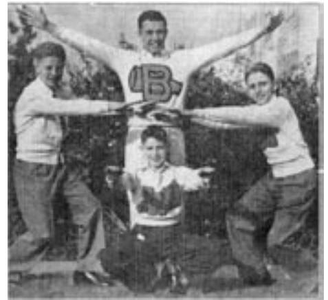
SCOUTS WILL BE WELL LEADERS—In front right of the yell books of the